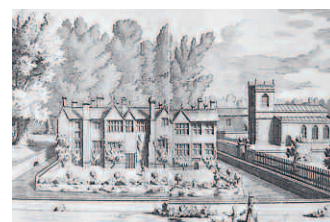
Okeover Hall 1686 (detail)