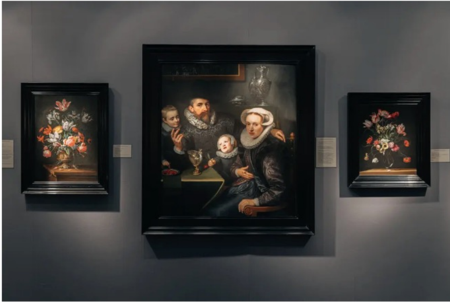
Center, a family portrait, circa 1608, by an “anonymous master” of Delft at Lawrence Steigrad Fine Arts.