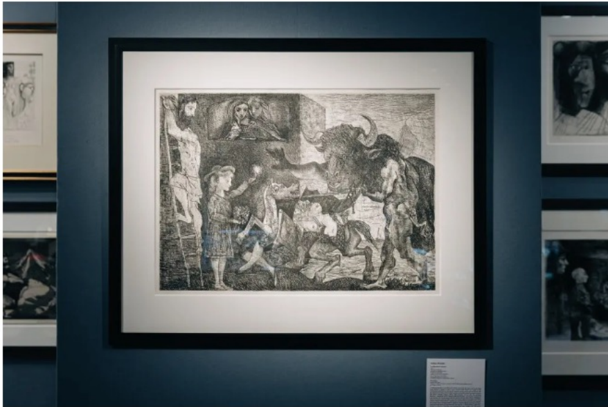
Pablo Picasso's "La Minotaumachie," 1935 at John Szoke.

This exhibition of prints by Edvard Munch and Pablo Picasso is pretty much without flaw. Munch wrings an amazing range of tones and textures out of simple black and white, particularly when he surrounds a face, or figure at a piano, with expanses of unbroken ink. As for Picasso, look for his famously overdetermined meditation on the mythological underpinnings of life when it includes both wife and mistress, "La Minotaumachie," 1935. Coming upon the sculptured, skeletal, bemused-looking goat in 1952's "La Chèvre," around the corner, may lead you to hope that wisdom sometimes comes with age.