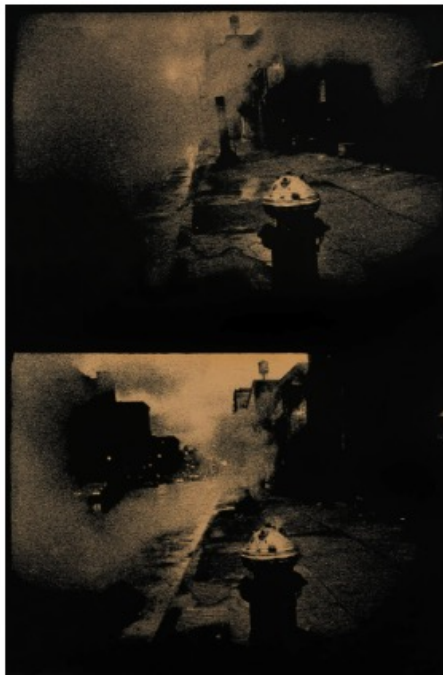
Daido Moriyama found a series of 35-millimeter “half-frame” negatives he had shot in New York in 1971 and reprinted them at large scale. Daido Moriyama; via Daniel Blau, Munich

Last year the Japanese street photographer Daido Moriyama found a series of 35-millimeter “half-frame” negatives he had shot in New York in 1971 and reprinted them at large scale. Each of the large, bronze-toned, black and white prints that resulted is a double image, showing some humble but iconic Gotham sights — steam enveloping a fire hydrant, a black cat in an anonymous hallway — at two successive moments. It’s an ingenious way to capture the cinematic romance of a gritty but world-renowned setting that is always changing but never goes anywhere.