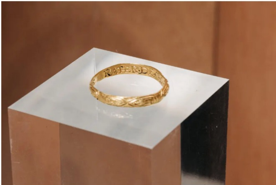
Posy ring inscribed with the words "Rather Deathe Then False of Fayte," 17th-18th century at Les Enluminures.

This gallery shines its special light on works from the Renaissance and Medieval eras, but there's plenty to explore even if you're not a collector. Like a rare English men's collar in partially gilt silver. The illuminated manuscript "Hours of LeGoux de la Berchère?" Reground yourself, if needed, with a homely gold "posy ring" inscribed around the inside with a reassuring motto like "I am but a token," "I live in hope," or "Rather Deathe Then False of Fayte."