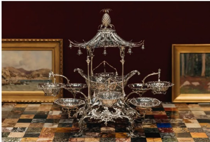
Thomas Pitts, George III antique English silver Epergne, a botanically themed silver serving dish from 1762, at S.J. Shrubsole.

Standing out from the glittering wealth of silver at Spencer Marks is a yachting trophy in the shape of a crashing wave, likely made by Gorham for the 1893 Columbian Exposition (though apparently not finished in time). With the intricately hammered texture of a giant ridged potato chip, the cup must surely have cost more man hours than any yachting victory it could have ever been awarded to. Over at Shrubsole, I couldn't look away from the contemporaneous Chinoiserie "epergne," a botanically themed silver serving dish whose nine separate floating bowls are surmounted by a pagoda roof topped with a pineapple.