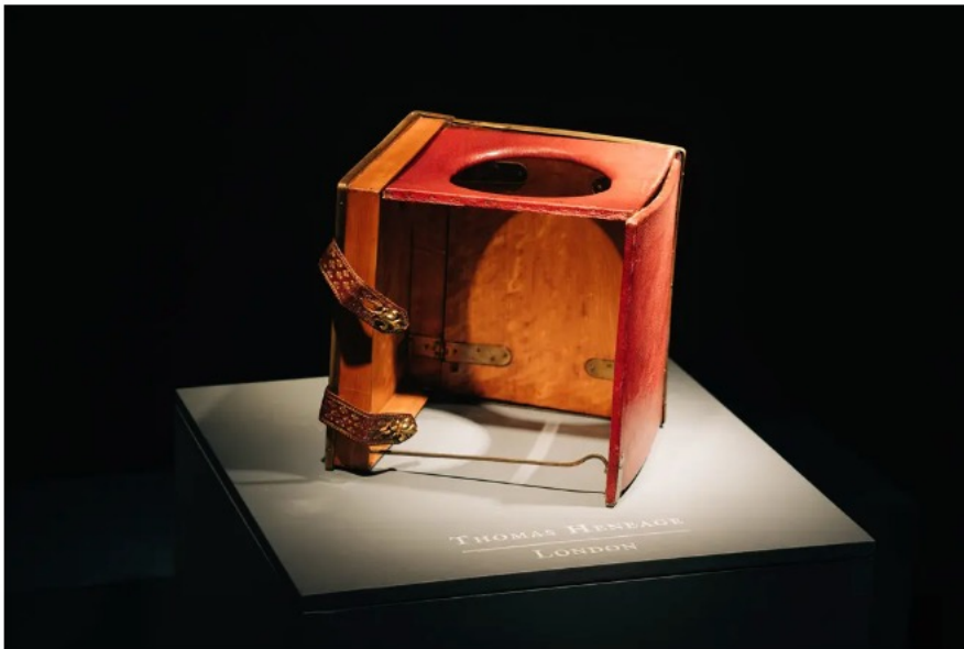
A chamber pot cover, in the shape of a book, made for Louis XIV's son the Grand Dauphin, at Thomas Heneage Art Books.

Most notable among this London dealer's antique books is a volume in full red Morocco gilt. On its spine fleurs-de-lis alternate with gamboling dolphins, while its cover bears the arms of Louis XIV's heir, the Grand Dauphin. But there's nothing inside to read. Unfolding into a discreet box with a red leather seat on top, it would have concealed a tin or ceramic chamber pot, no longer extant, for the Dauphin's sons. Its title is an inspired, if puerile, political joke about the perennial enemy of the deeply Catholic king of France: "Histoire Naturelle des Pays Bas" could translate both as "History of the Netherlands" and "History of the nether regions."