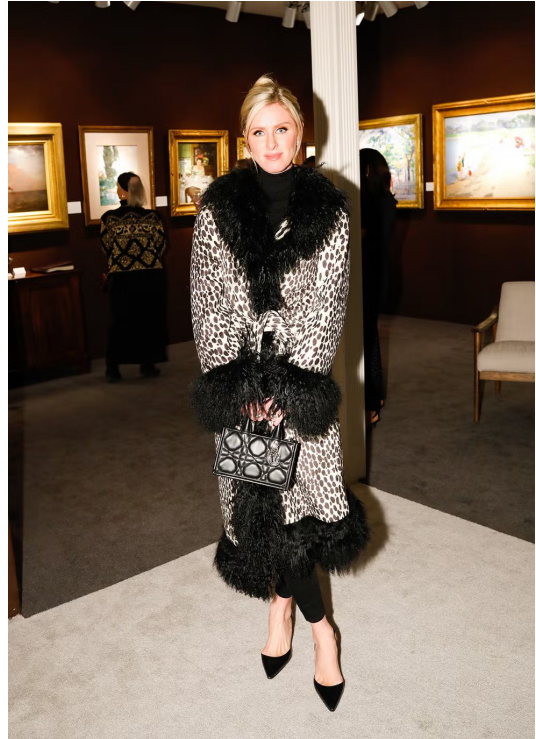
Nicky Hilton Rothschild