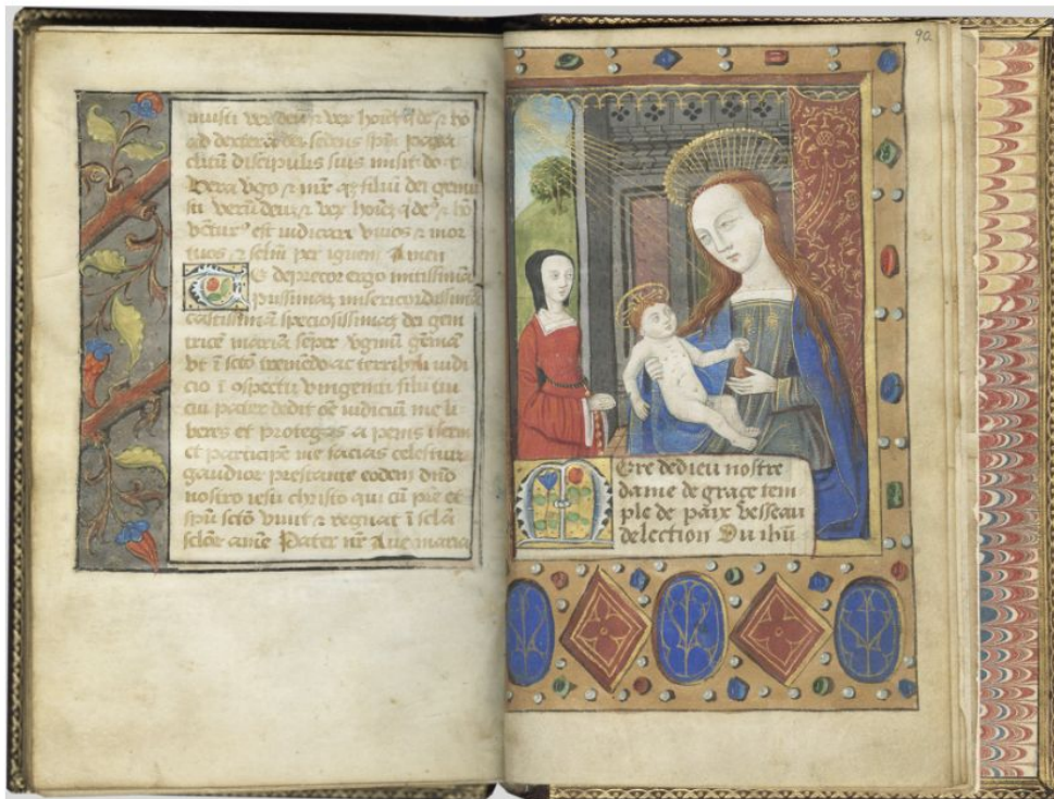
Book of Hours (Use of Rouen) (ca. 1480–1490).

Bibliophiles and medieval art fans alike will delight in the dynamic presentation by Les Enluminures, whose booth is lined with richly embellished illuminated manuscripts and several exhibitions within the exhibition. One of these is “In Her Hands: Women and Medieval Manuscripts,” showcasing eight remarkable prayerbooks that, together, highlight women’s patronage in the Middle Ages and early Renaissance. Glittering gold leaf, saturated colors, and minute detailing illustrate the incredible craftsmanship of these objects.