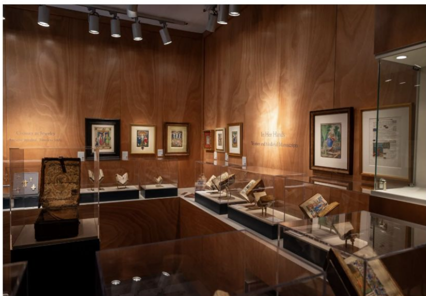
Installation view of “In Her Hands: Women and Medieval Manuscripts” (2025) at Les Enluminures.