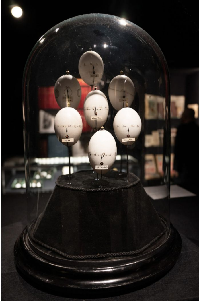
Charles William Croydon, Duck Egg Clock (ca. 1900).

Arguably the most peculiar and intriguing object on view at the Winter Show is a fully functioning Duck Egg Clock from around 1900. As the title suggests, the piece comprises seven duck eggs, each indicating the hour, minute, second, day, month, and even moon phase and current tide level respectively. Made by Charles William Croyden of Ipswich, the delicacy of the blown-out eggs and mechanical elements make the piece's survival of more than a century a wonder in its own right, and the eggs' steady rotation a marvel to see.