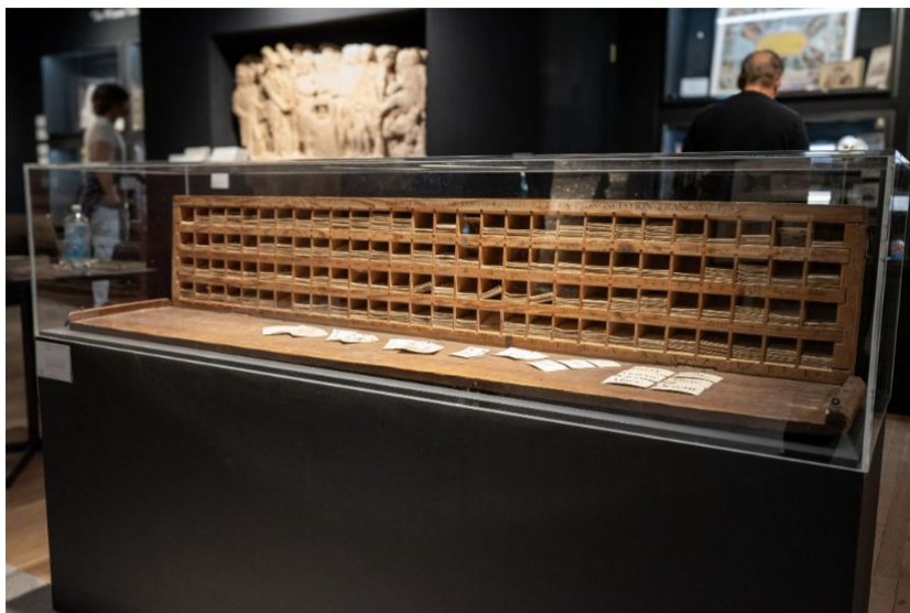
The bureau typographique, with new topics (1789).

Another two objects on view that have seemingly defied the odds when it comes to survival are two wooden chests, each with more than a hundred slots containing thousands of adapted playing cards at Daniel Crouch Rare Books. Hailing from the Verame Playing Card Collection—recognized as the largest playing card collection in private hands—the chests date from 1789 and 1782. There are only four such bureaus extant in the world, and Daniel Crouch is steward to three.