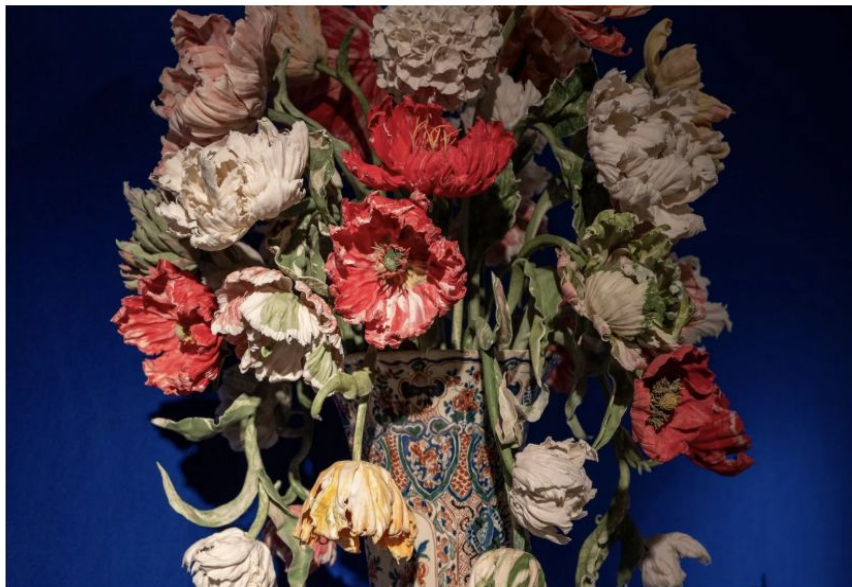
Anna Volkova, detail of Whispers of Time (2024).

Recalling 17th- and 18th-century still life paintings, Whispers of Time could be mistaken as being from the same period as the vase, and entices closer looking (though not too close of course, as the work is incredibly fragile).