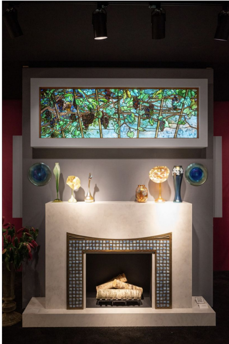
Installation view of Lillian Nassau LLC at the Winter Show 2025.