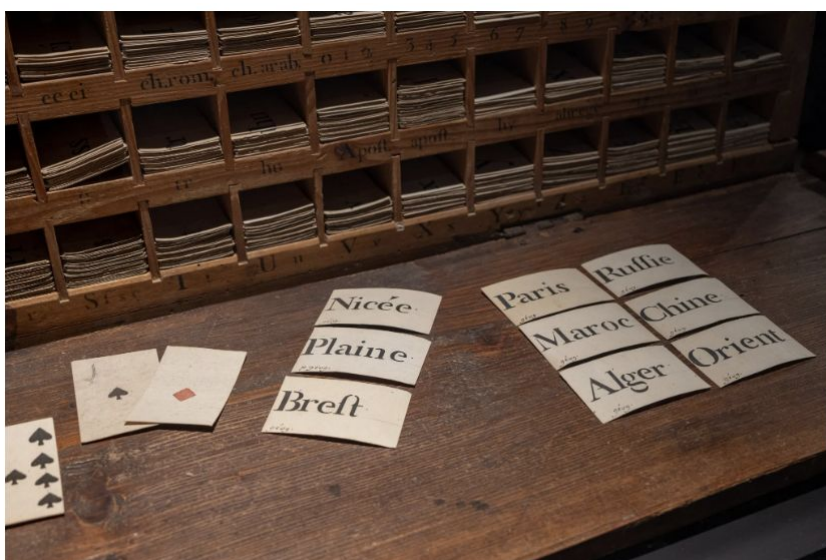
Detail of the bureau typographique, with new topics (1789).

Another two objects on view that have seemingly defied the odds when it comes to survival are two wooden chests, each with more than a hundred slots containing thousands of adapted playing cards at Daniel Crouch Rare Books. Hailing from the Verame Playing Card Collection—recognized as the largest playing card collection in private hands—the chests date from 1789 and 1782. There are only four such bureaus extant in the world, and Daniel Crouch is steward to three.