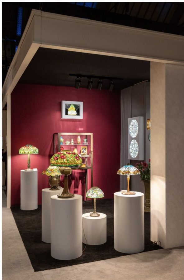
Installation view of Lillian Nassau LLC at the Winter Show 2025.

Nothing is quite the crowd pleaser as Tiffany Studios, and Lillian Nassau LLC's booth is a veritable Tiffany paradise. Featuring everything from a collection of Tiffany's iconic lamps to one-of-a-kind windows to iridescent vases, the booth offers a wide-ranging look at the creative output of the famous producer's output.