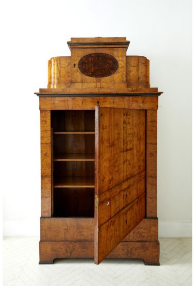
German Neoclassical Biedermeier cabinets.