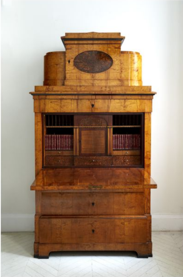
German Neoclassical Biedermeier cabinets.