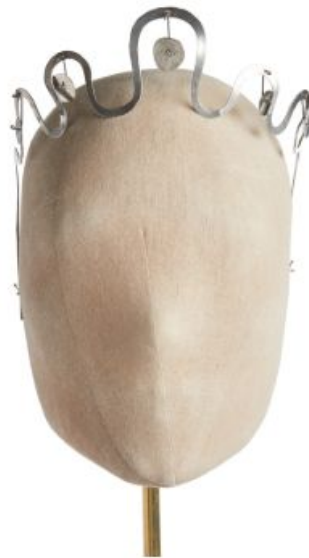
Alexander Calder tiara.