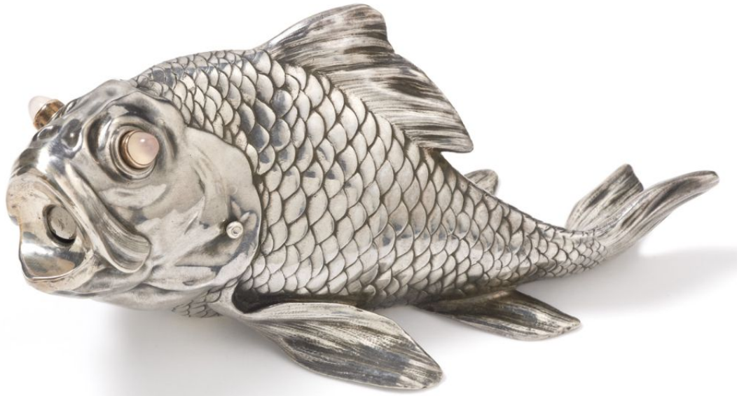
A silver cigar cutter by Carl Fabergé, St. Petersburg, circa 1908.