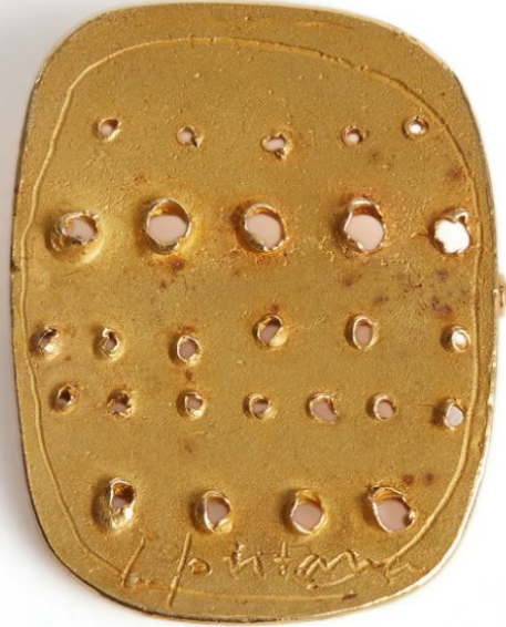
Gold brooch by Lucio Fontana.