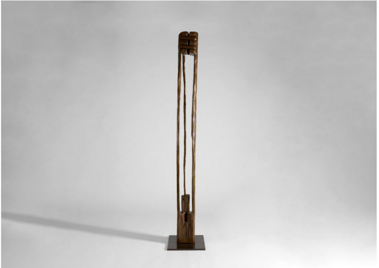
Hilabeteak IX , by Kepa Akixo (known as Zigor) (b. 1948).

“A world-traveling journalist and photographer turned artist—a true Renaissance man! His work reflects a deep connection to the Basque region, beautifully capturing its natural landscape and cultural identity. With a focus on simplicity and sensitivity, his sculptures and drawings achieve a harmonious balance between material and space. Remarkably, even his largest bronze pieces convey a sense of lightness.”— Christine Gachot