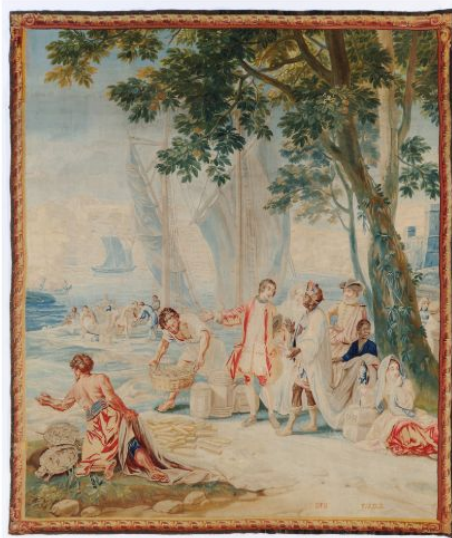
America Brussels tapestry.