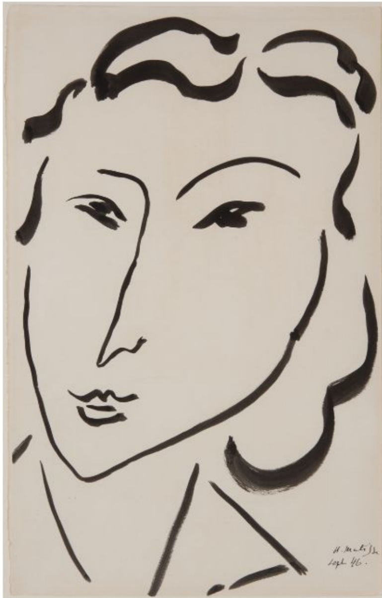
Tête de Jeune Fille (1946), by Henri Matisse.