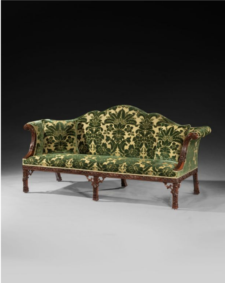
A pair of mahogany settees from the St. Giles's House suite, attributed to William Vile.