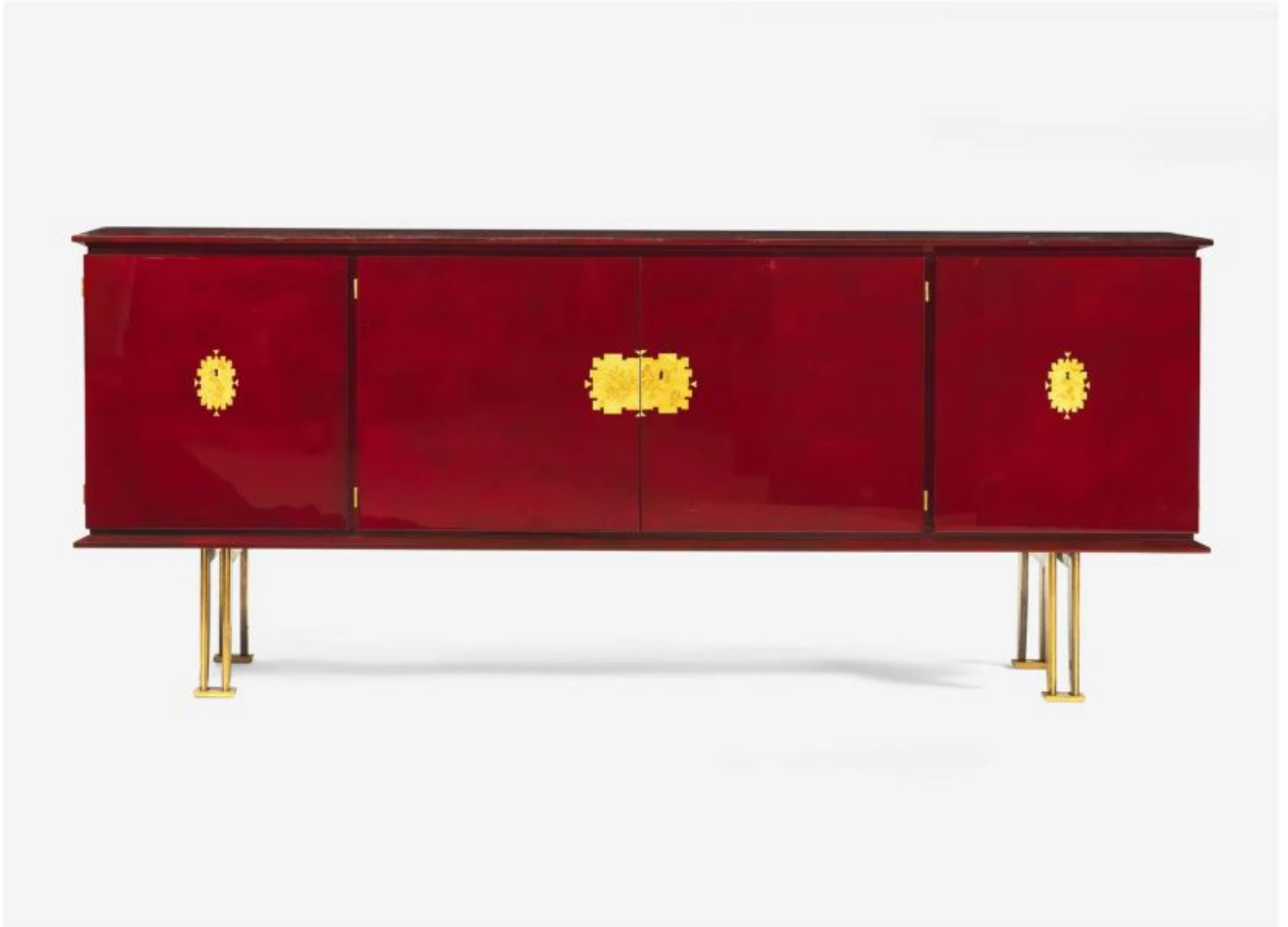
Red lacquered sideboard by Jules Leleu.