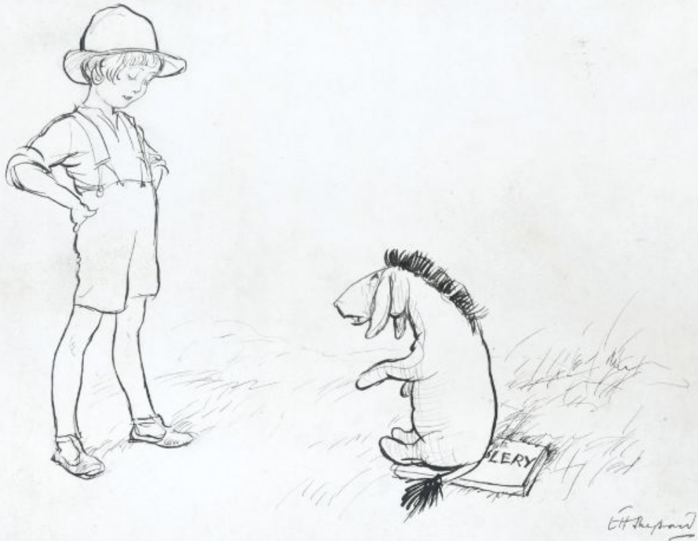
Original artwork by Ernest H. Shepard for The House at Pooh Corner “‘Good Morning, Christopher Robin,’ he said... ‘Are we alone?’”

“How delightful and extraordinary is the artifact of a moment in time? How many children yet to be born will meet and love these characters? Yet here they are, being born themselves on the sheet. This drawing is a very intimate thing, but it expresses a whole world.”— David Netto