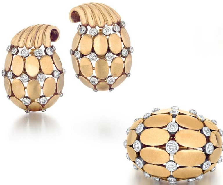
a Cartier ring and earring set from 1950 on view at the S.J. Shrubsole booth at The Winter Show 2023