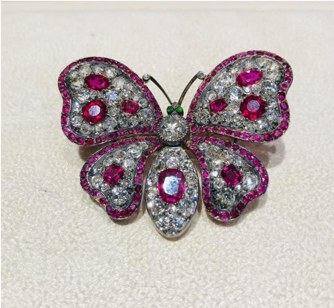
A La Vieille Russie ruby and diamond brooch from 1905 on view at The Winter Show 2023