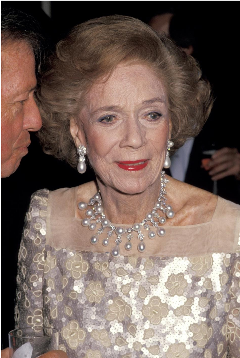
Brooke Astor during 2nd Annual Channel 13 WNET Gala at Plaza Hotel in New York City, New York, ... [+]

necklace by Oscar Heyman belonged to one of the legendary doyennes of New York Society, Brooke Astor, known for her taste, wit and incredible philanthropy.”