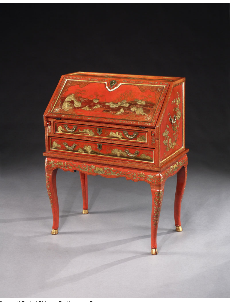
George II Period Chinese Red Lacquer Bureau on Stand