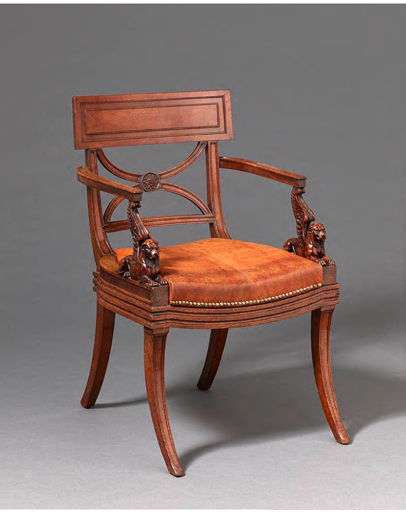
Early 19th century armchair.