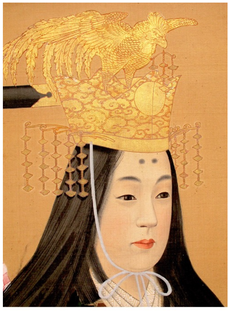
Set of Six Panels depicting The Imperial Royal Family, Japan, Meiji period, 2nd half of the 19th century, ca 1870.