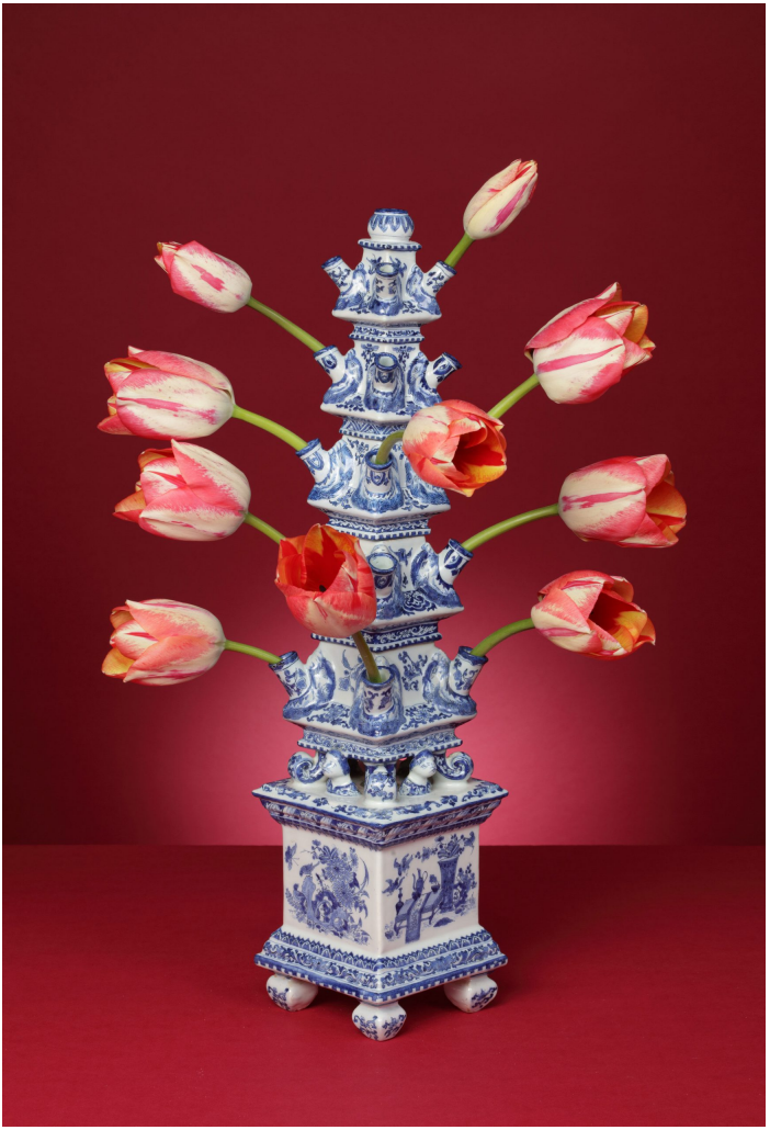
Blue and White Pyramidal Flower Vase